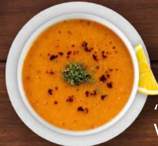
'Mercimek' Vegetable Soup