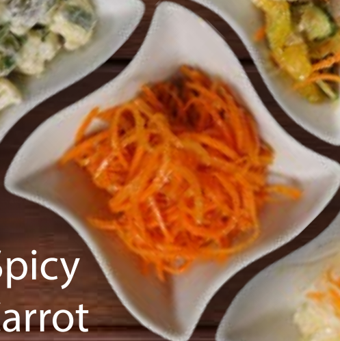
Spicy Carrot Salad