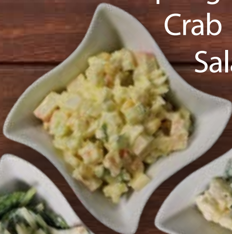
Spring Crab Salad