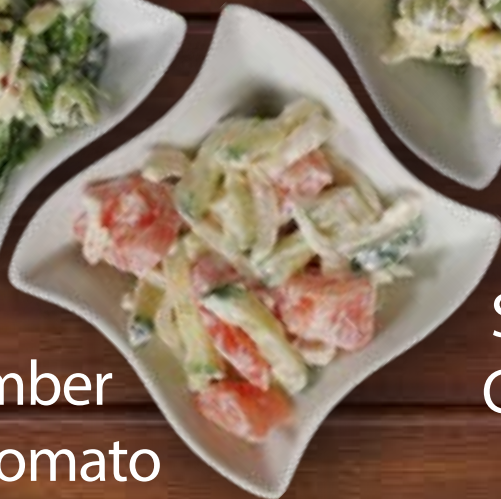
Cucumber Tomato Salad