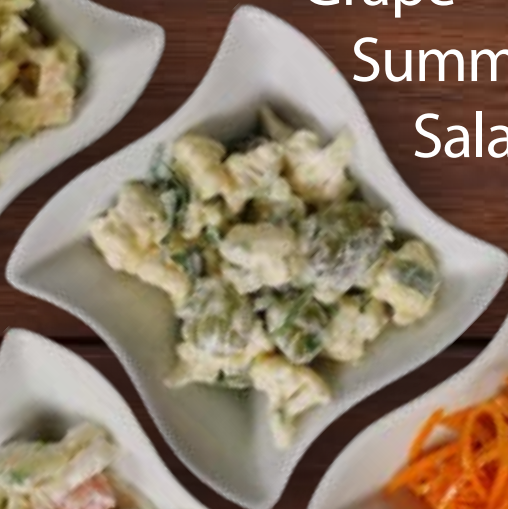
Grape Summer Salad