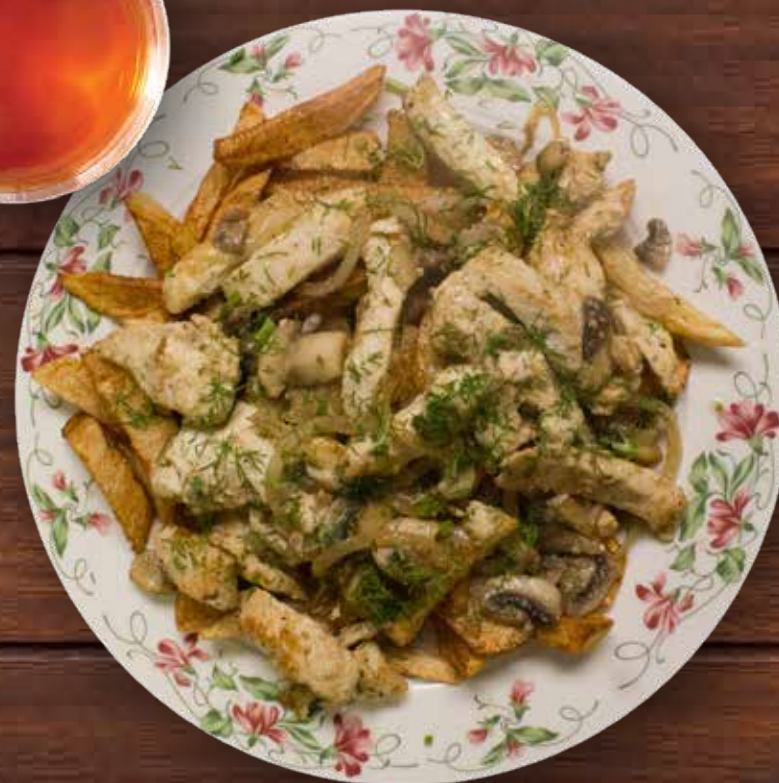
Fries $10.35 add Mushrooms & Onions add Chicken or Beef +$7.50