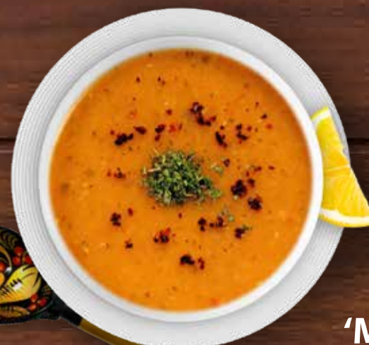
'Mercimek' Vegetable Soup