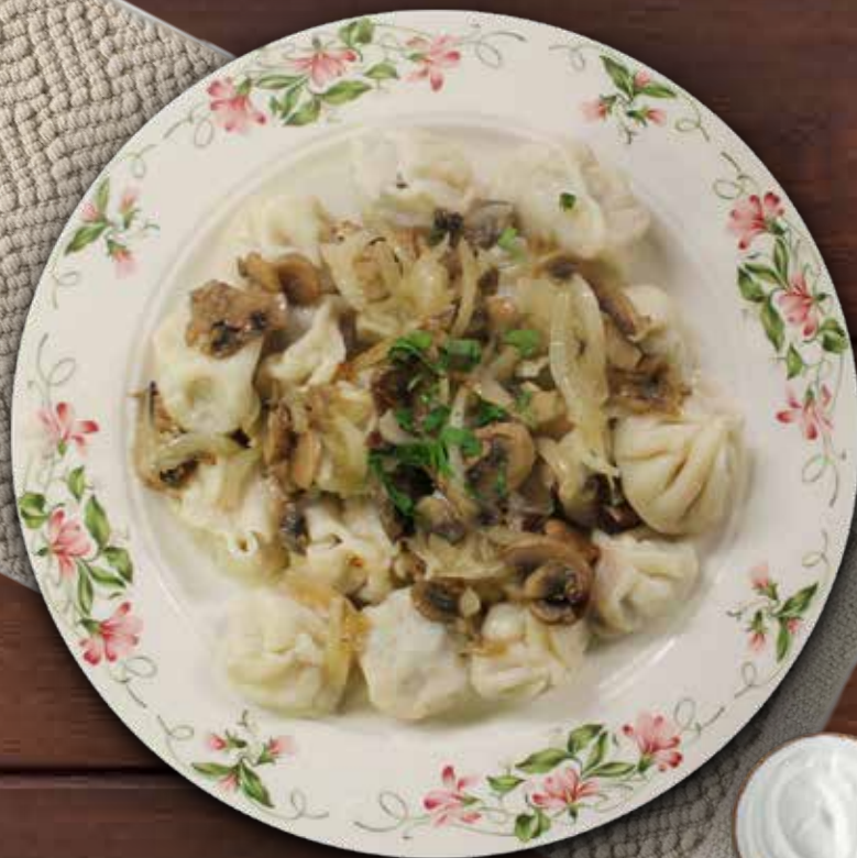
Pelmeni Dumplings $17.75 with Chicken or Beef add Mushrooms & Onions