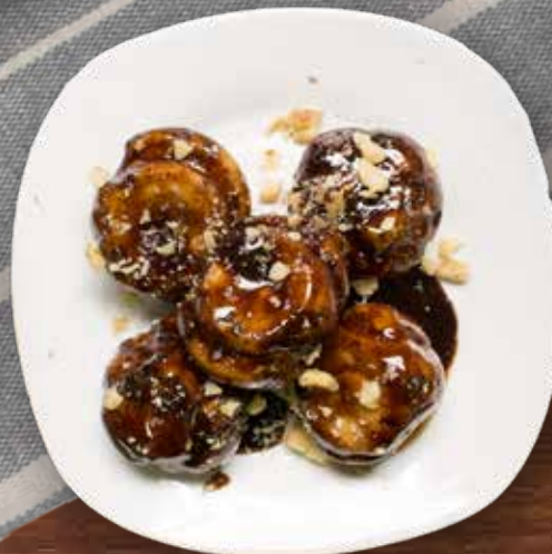
Cream Puffs $5.95