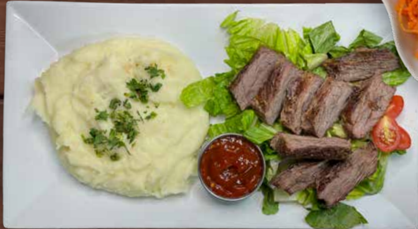
Flank Steak Strips